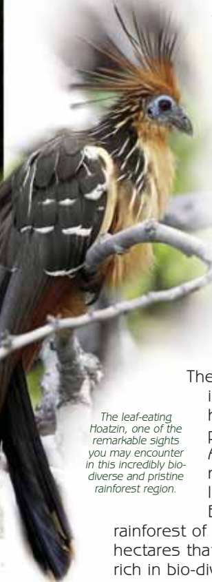
The leaf-eating Hoatzin, one of the remarkable sights you may encounter in this incredibly bio-diverse and pristine rainforest region.

This once in a lifetime holiday will take you to Quito in Ecuador and then to stay with the indigenous Huaorani people who inhabit this pristine rainforest and were one of the last of the major ethnic groups to be contacted by outsiders.